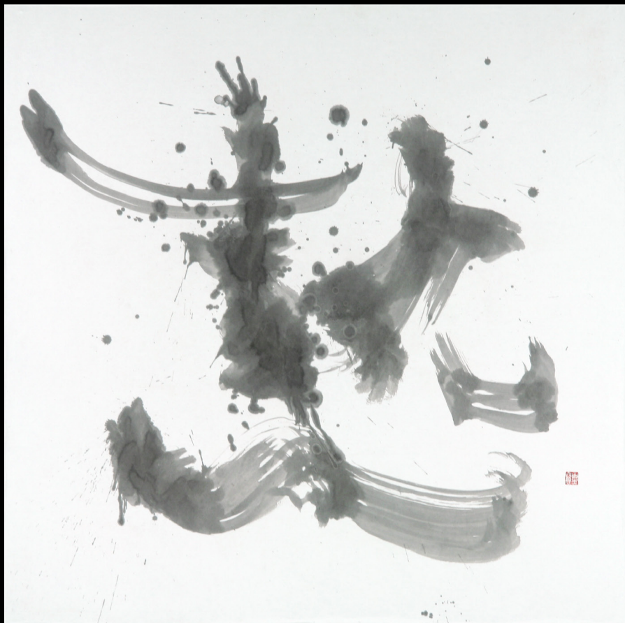
熱 Heat, 2010 Sumi-ink on paper mounted on wood panel 48 x 48 in