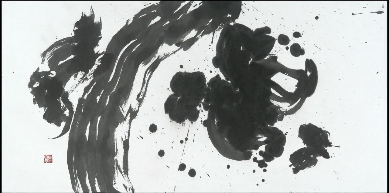
源 Origin, 2010 Sumi-ink on paper mounted on wood panel 24 x 48 in