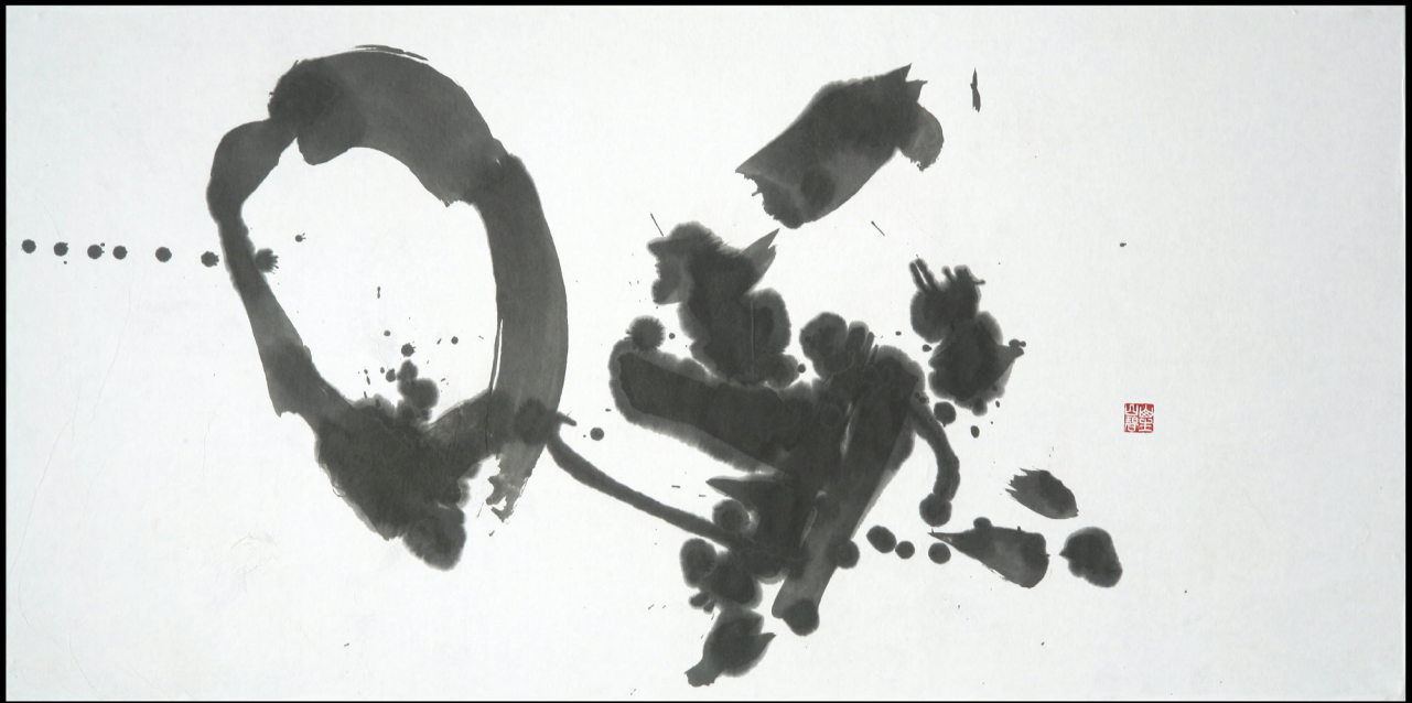
呼 Breathe, 2010 Sumi-ink on paper mounted on wood panel 24 x 48 in