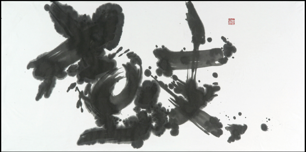
鼓 Heartbeat, 2010 Sumi-ink on paper mounted on wood panel 24 x 48 in