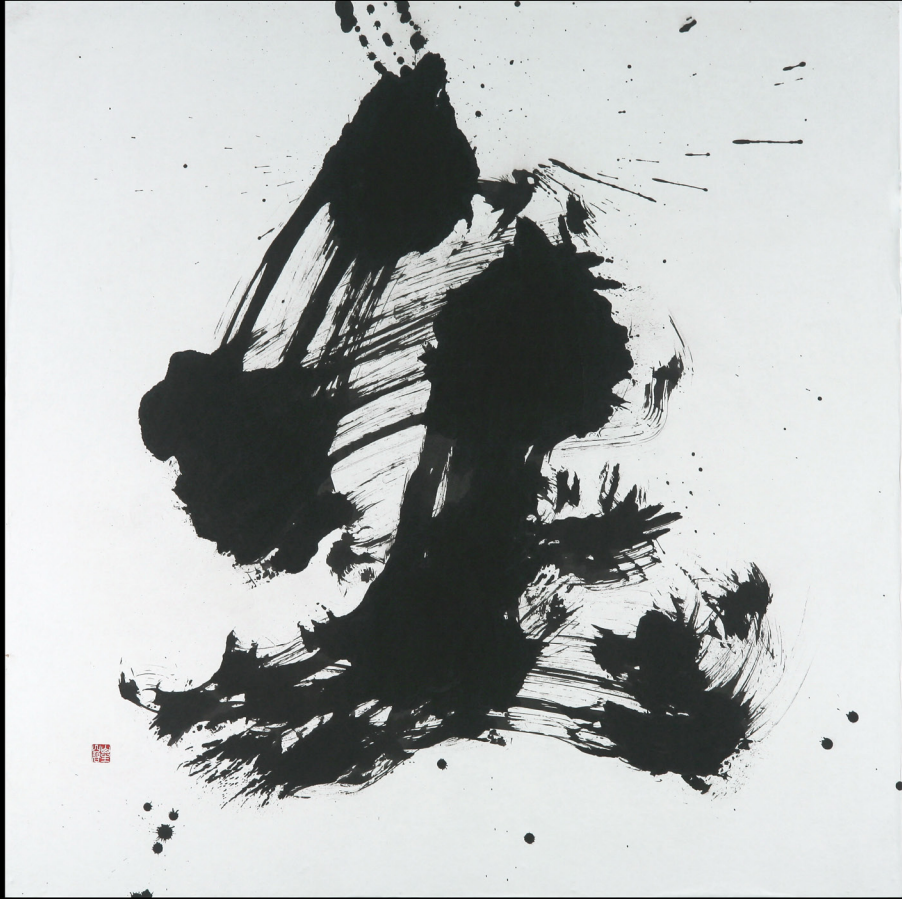
生 Life, 2010 Sumi-ink on paper mounted on wood panel 48 x 48 in