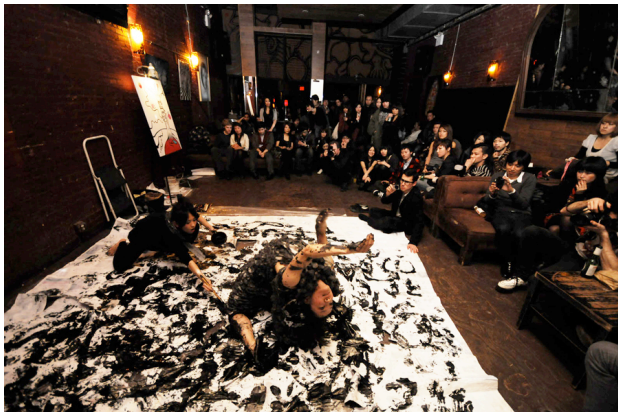
Live improvisational performance at CHISEKI -Traces of Nature- in NYC, March 2010 | VIEW PHOTOS